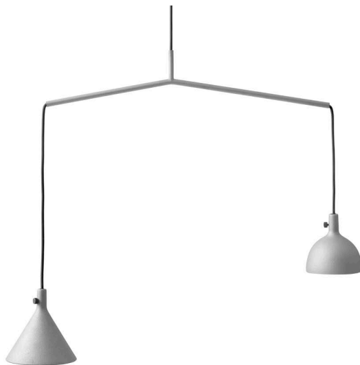
Aluminium / Bronzed Brass 1240009