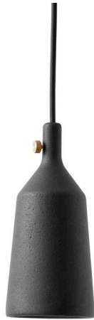
Black / Brass 1230539