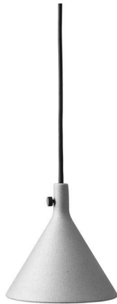
Aluminium / Bronzed Brass 1210009