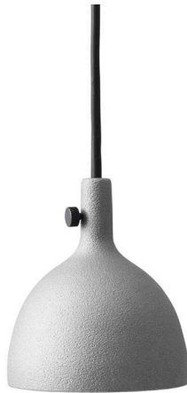
Aluminium / Bronzed Brass 1220009