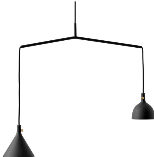
Black / Brass 1240539