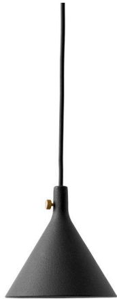
Black / Brass 1210539