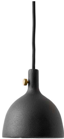
Black / Brass 1220539