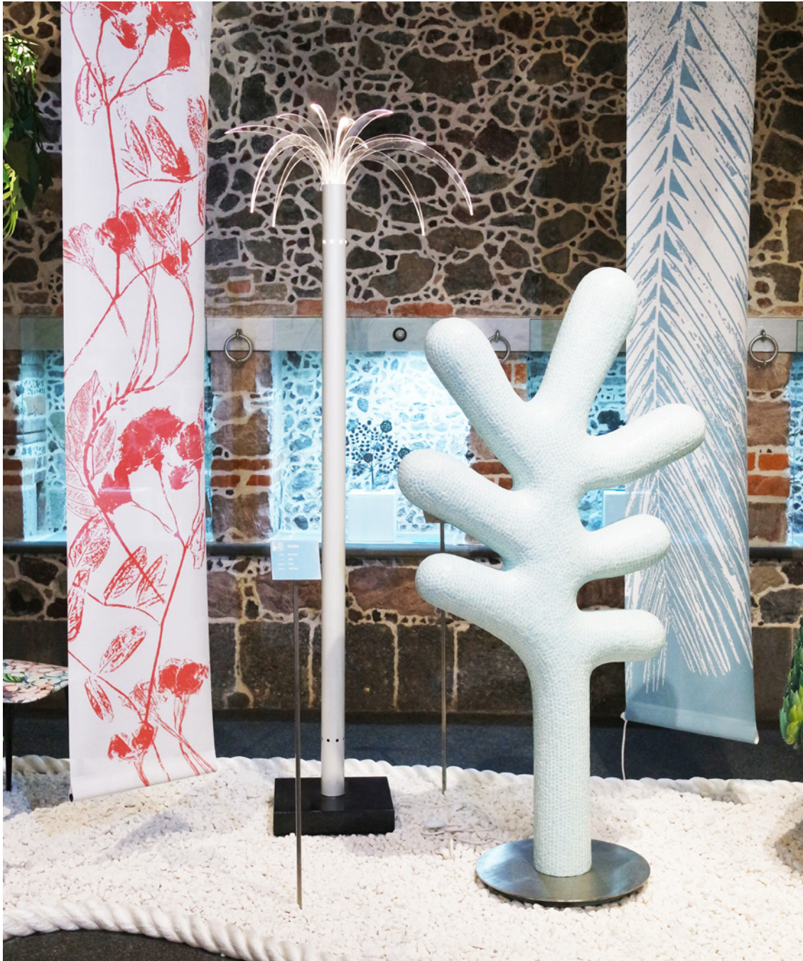
↙ Vegetal House, MUMEDI, Mexico City. 2018