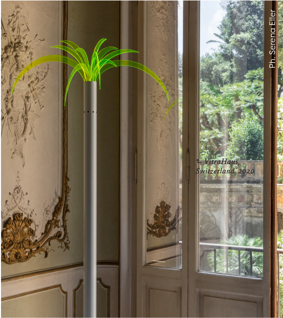
↘ Africano, Cluster Palazzo Brancaccio, Rome. 2021