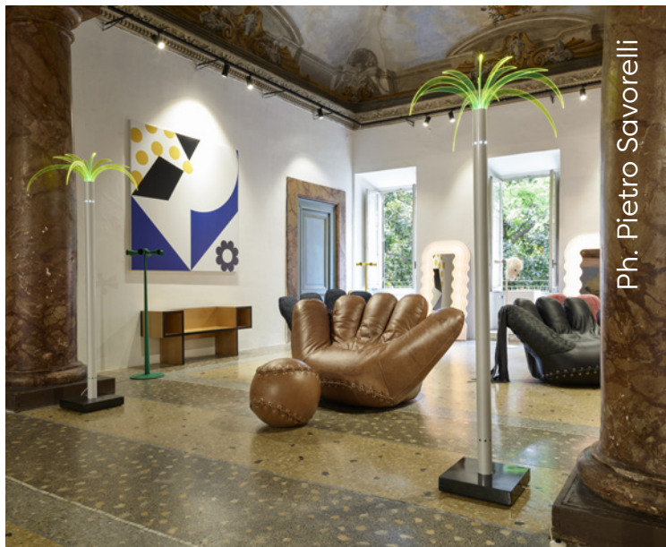
↙ Contemporary Cluster, Roma. 2020