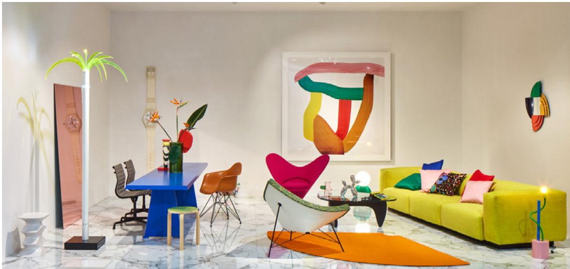
↖ Vitra booth, Milan Furniture Fair. 2019