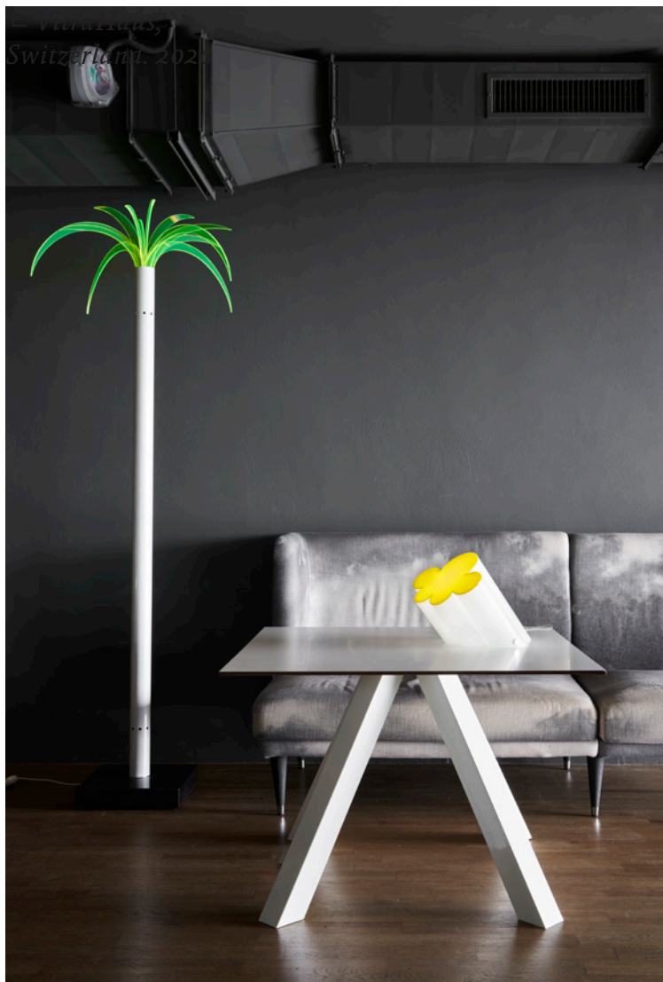
↵ The Student Hotel, Firenze. 2020